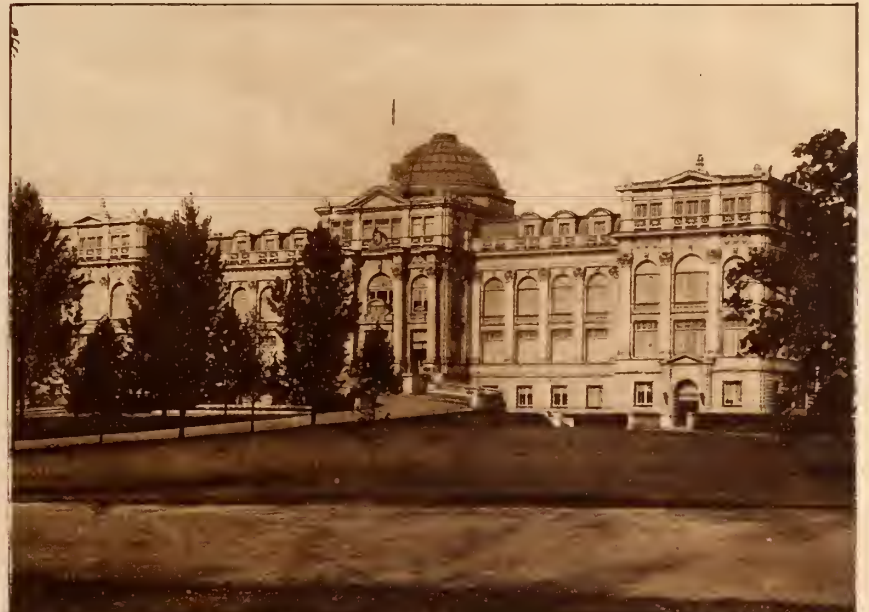
BOTANICAL MUSEUM in Bronx Park.